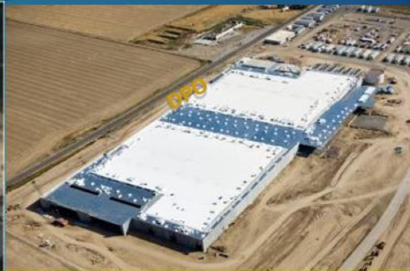
Data Centers around the World